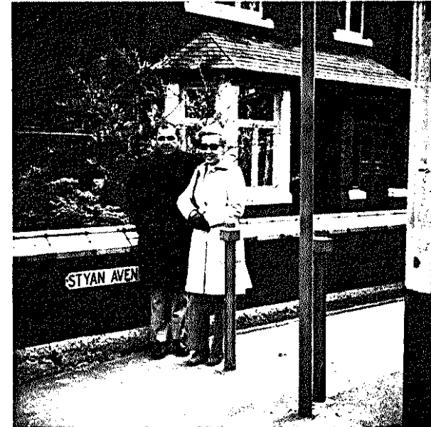
Styans from Hawaii at Styan Avenue, Whitley Bay, Northumberland, England.

As the 3 in Illinois are known already and the 2 in Hawaii are now known, your Chronicler is sorely tempted to contact the remainder. However as the distribution list for these Chronicles now approaches 40 any further potential increase to this is being viewed with some caution.